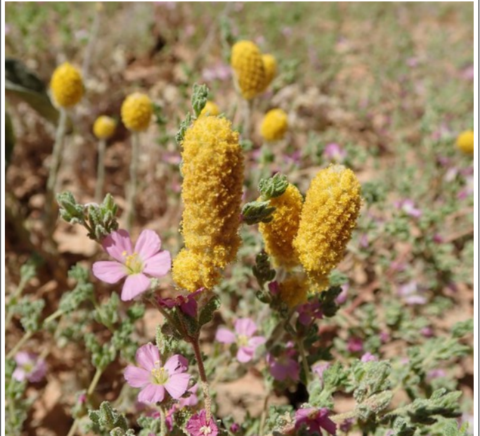
Pynosorus (yellow) and Frankenia (pink)