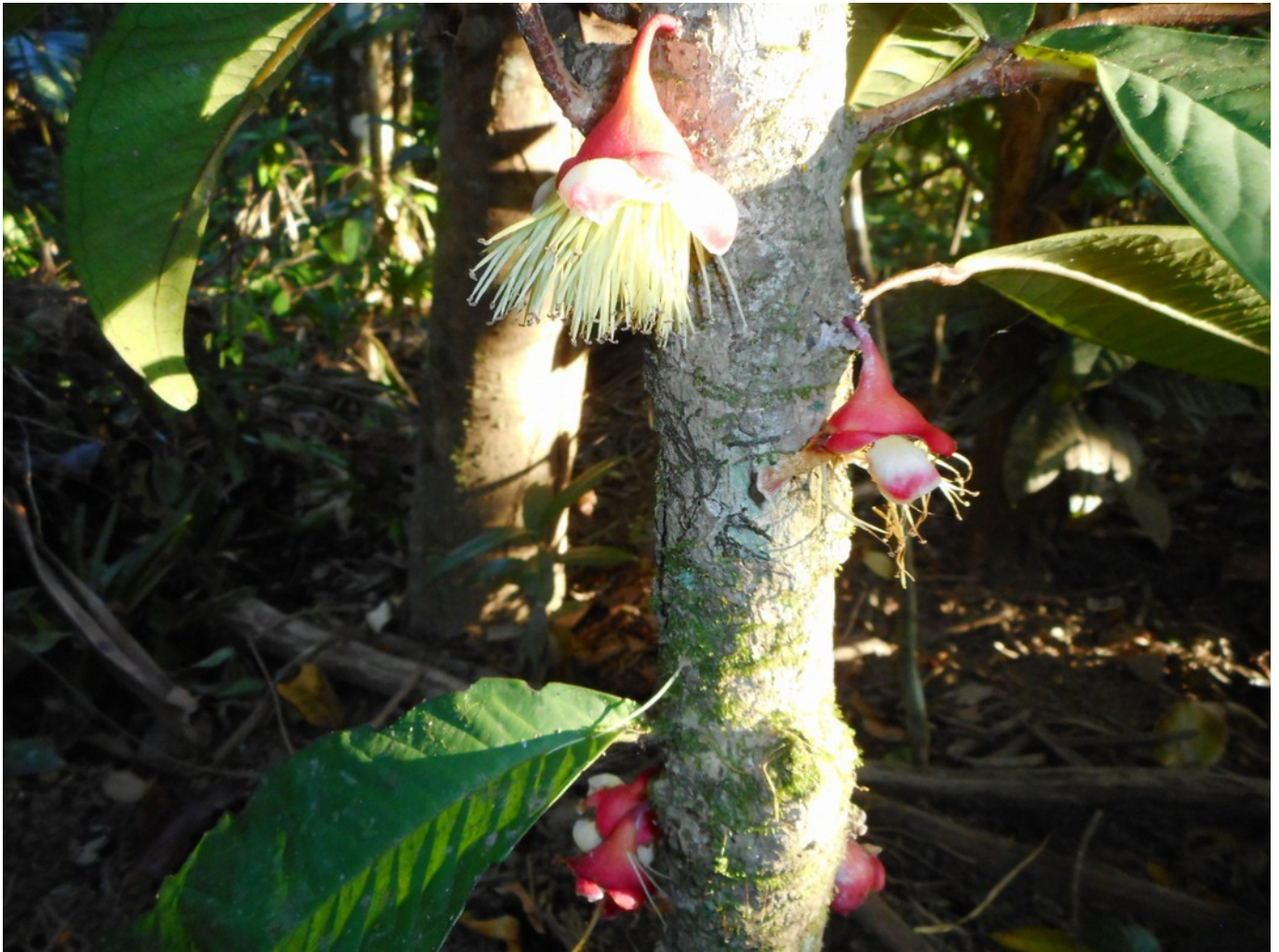
Syzygium erythrocalyx cultivated by Don Lawie.

Don Lawie reports that his "little tree may be about twenty years old; I think it may have come from a Friends of the Garden Father's Day sale. I moved it twice - [the first location had] too much sun for the big leaves, then [the second location had] not enough light, and now it seems fairly happy. It flowered a few years ago but we were away and it didn't set fruit."