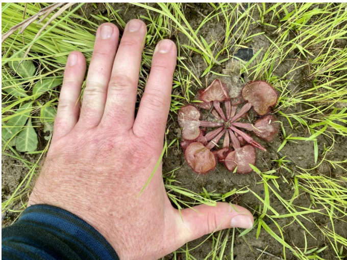
Drosera falconeri , which was a major target of mine for the trip that I found around Berry Springs just before having to fly out. This seen and is a fast favourite.