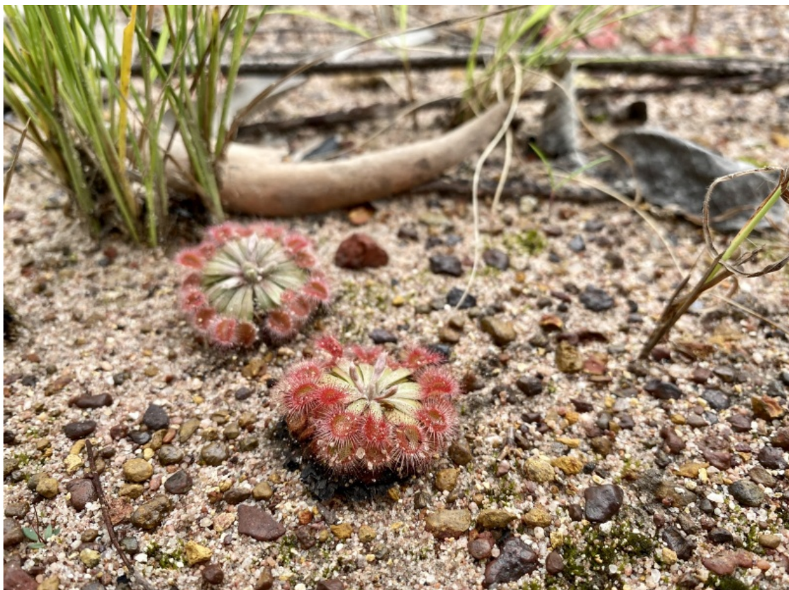
What is potentially Drosera darwiniensis. One of the many drosera species incidentally found during the trip.