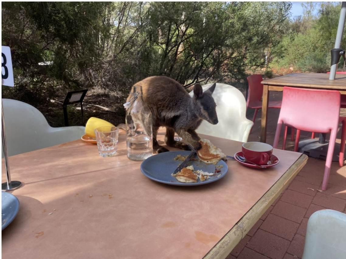
Black-footed Rock-wallaby having breakfast at the Alice Springs Botanical Gardens. The Purple-necked Rock-wallaby, a species listed species so it was another target for me. However, seeing them for the first time like this wasn't exactly how I'd envisioned seeing them.