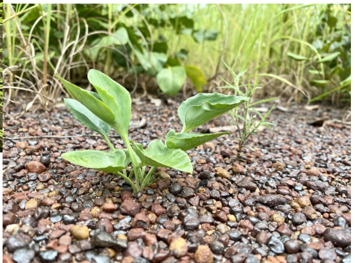
What is likely to be a Typhonium praetermissum . We had to survey for this species and ended up finding hundreds of them in the Howard had finished so only leaves were about.